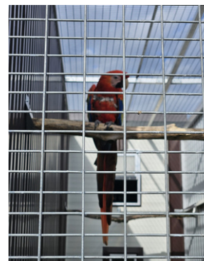
AFTER 2 treatment cycles of 30 days each.